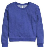
Blue Sweatshirt (no logo)