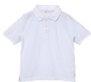
White Air-Tex t-shirt